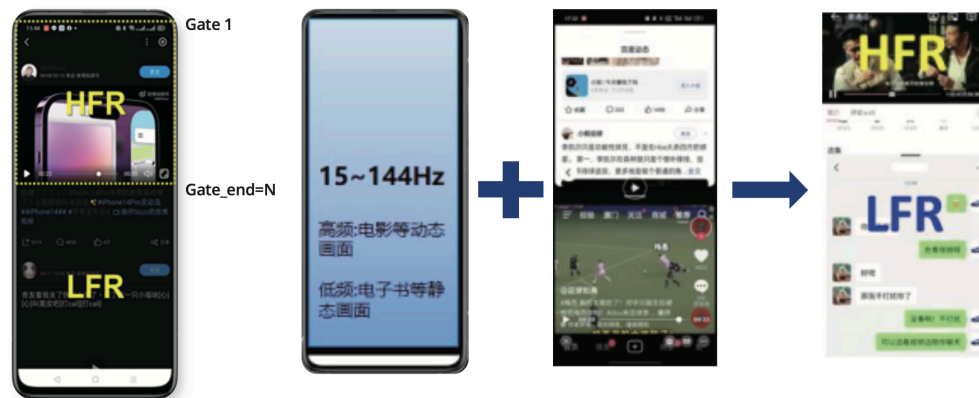
MFD Multi-Frequency Drive