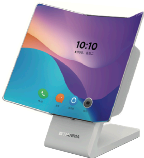
9.94" Multiple Foldable OLED