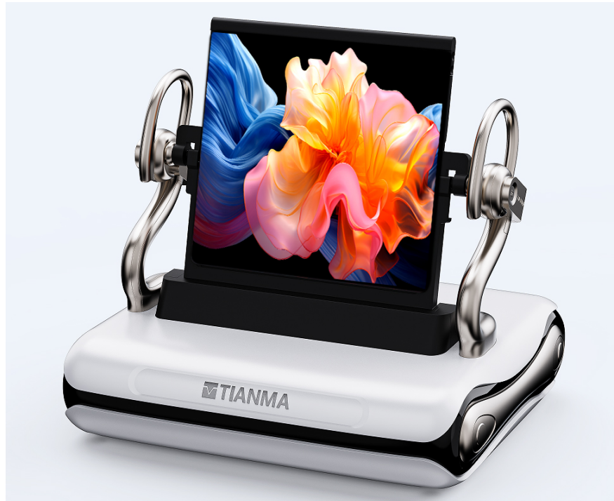
7.92" LTPO Outer +POL